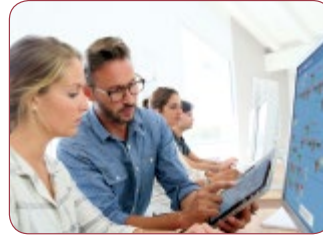
System Knowledge Modules