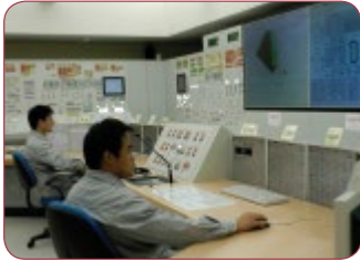
Full Scope Simulators