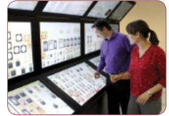
Part-task and Classroom Simulators