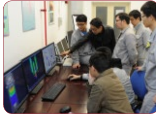
Severe Accident Simulation